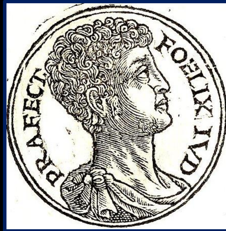
Marcus Antonius Felix Roman Procurator over Judea (A.D. 52-60)