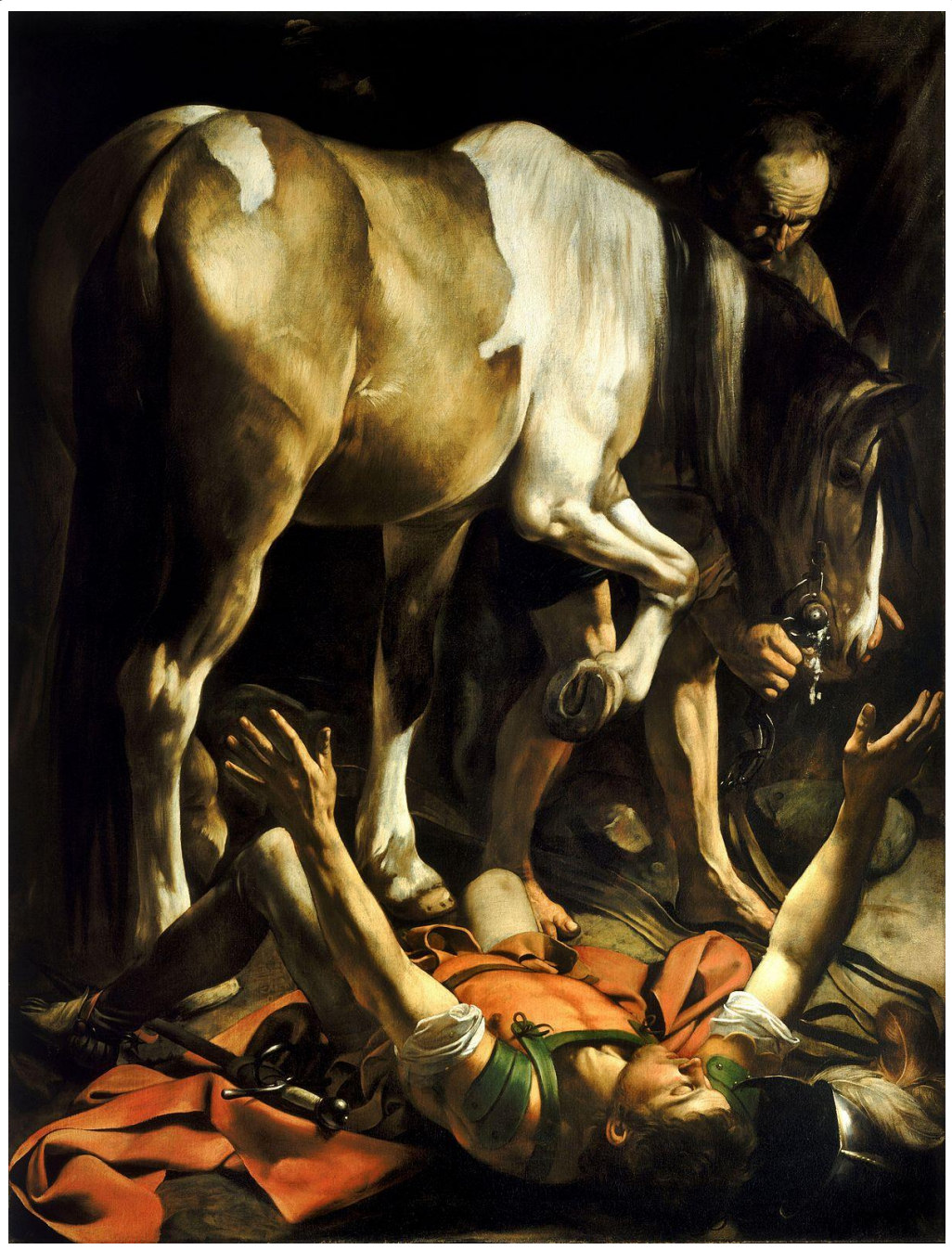
“The Conversion of St. Paul” by Caravaggio (c. 1601)